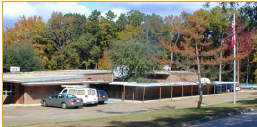
West Woods Charter Elementary School

looking for a technology-based intervention strategy to improve the essential reading skills and motivation of the students. After careful consideration and examination of the efficacy and instructional approach of Learning Today's Smart Tutor™ program, they determined that it could be effective with their "At Risk" student population. They decided to adopt it as an intervention program to assist them in their goal of improving their students' academic performance.